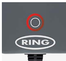
Red Solid LED – Battery Fault