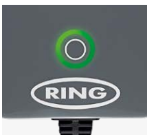
Green Flashing LED – Charging mode